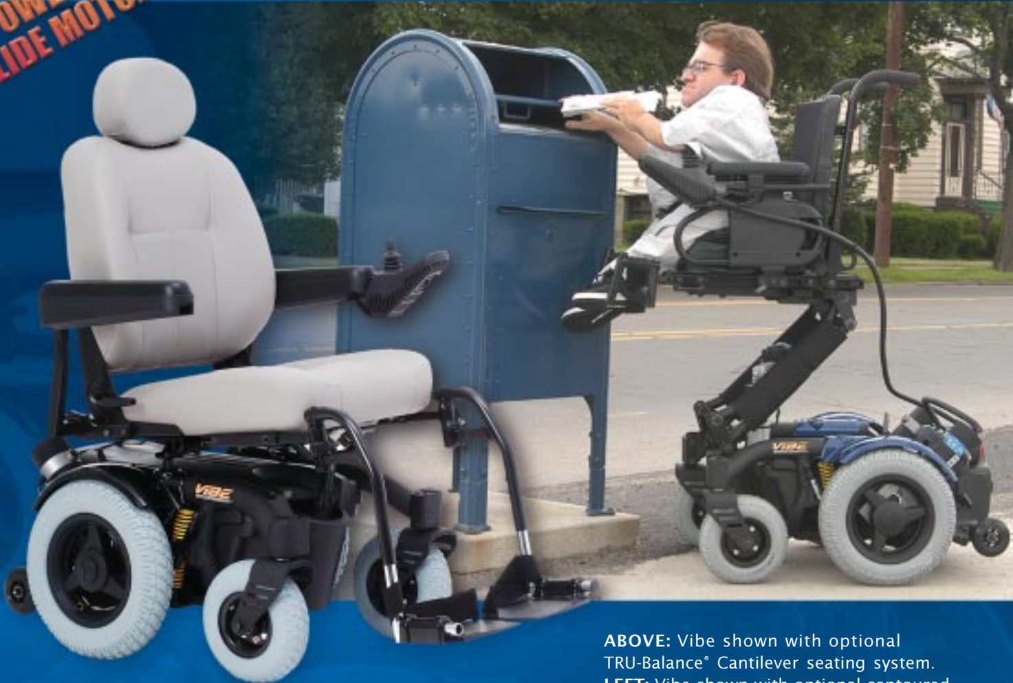
ABOVE: Vibe shown with optional TRU-Balance® Cantilever seating system. LEFT: Vibe shown with optional contoured high-back seat and swing-away footrests.