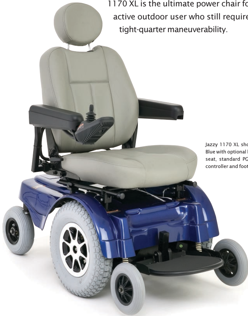
Jazzy 1170 XL shown in Viper Blue with optional high-back seat, standard PG VSI controller and foot platform.

1170 XL is the ultimate power chair for the active outdoor user who still requires tight-quarter maneuverability.