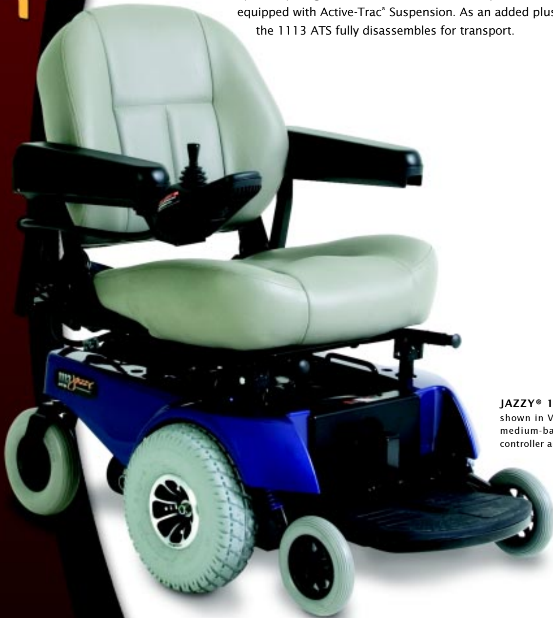
JAZZY® 1113ATS shown in Viper Blue with medium-back seat, PG VSI controller and foot platform

For sharp ramp transitions as well as a smooth and stable ride even over exceptionally rough and uneven terrain, the Jazzy 1113 ATS is equipped with Active-Trac® Suspension. As an added plus, the 1113 ATS fully disassembles for transport.