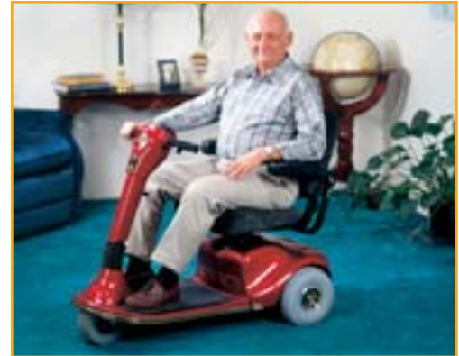
Attractive and comfortable