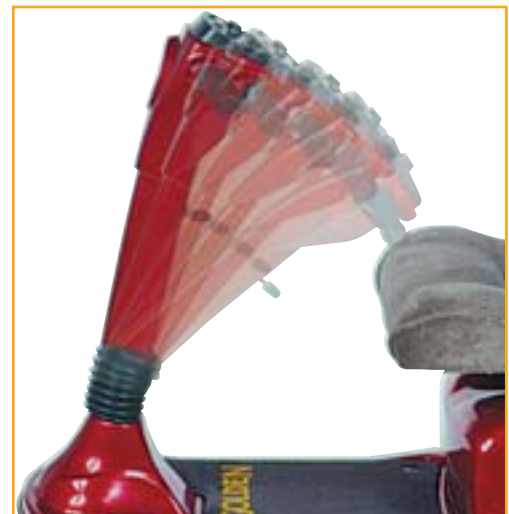
Patented infinite adjustable tiller