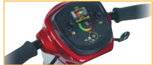
Easy to operate