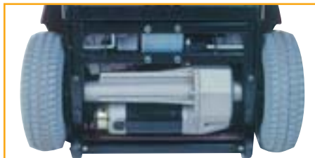
Quiet & maintenance free motor