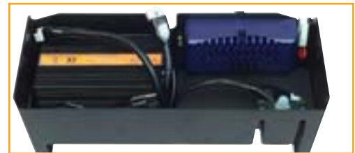
On-board self-diagnostics system