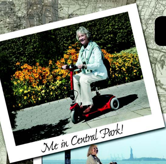
Me in Central Park!

It easily disassembles into four lightweight pieces that fit into car trunks, closets, and other small spaces, making it convenient to take anywhere, whether your destination is a trip abroad or a trip to the mall.