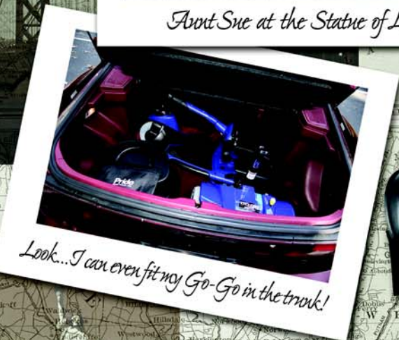
Look...I can even fit my Go-Go in the trunk!