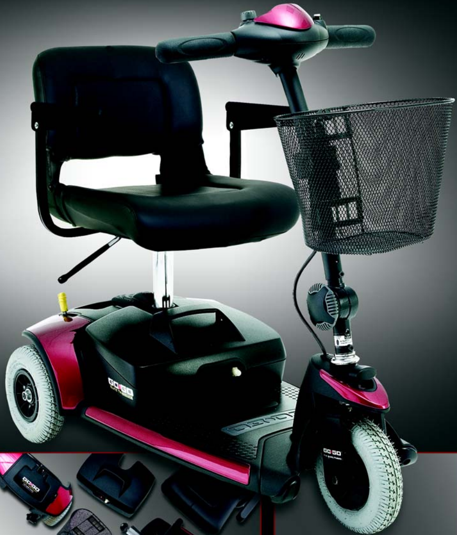
3 sets of interchangeable shroud panels for 3 looks with 1 scooter