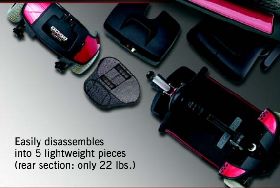
Easily disassembles into 5 lightweight pieces (rear section: only 22 lbs.)