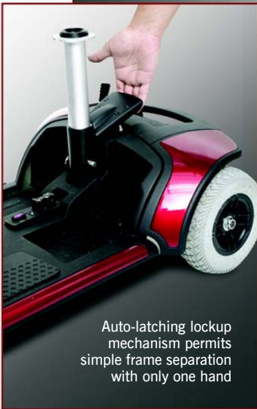
Auto-latching lockup mechanism permits simple frame separation with only one hand