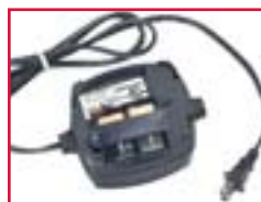
Battery Backup System

Smooth, quiet lifting system offers a secure lift for the best performance.