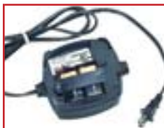
Battery Backup System

Smooth, quiet lifting system offers a secure lift for the best performance.