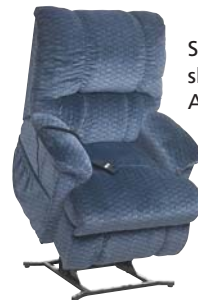
Space Saver shown in Atlantic fabric

Batteries not included. Safety System is designed to bring chair from recline to seated position in the event of a power outage.