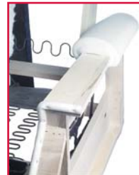
501 M shown