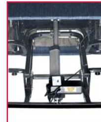
501 M shown