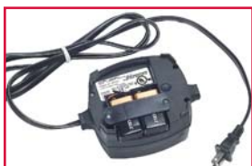
Battery Backup System

Smooth, quiet lifting system offers a secure lift for the best performance.